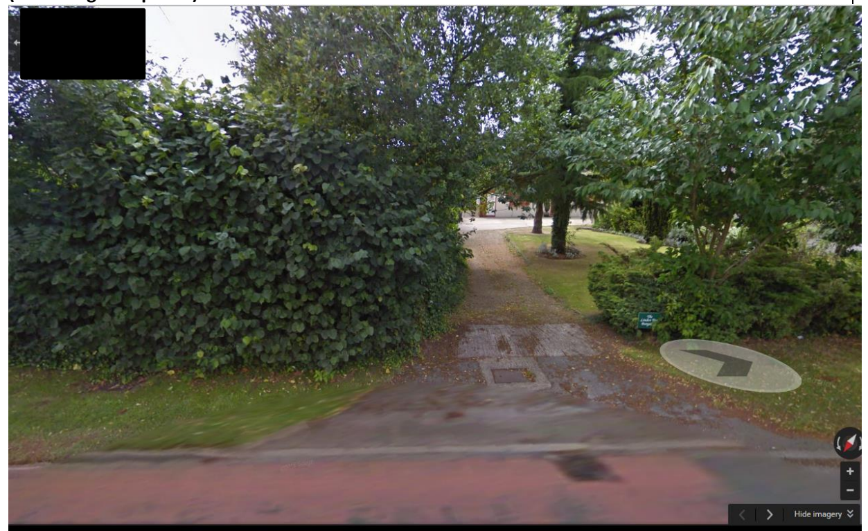
Photo1 – Looking south-east to site access, proposed to left of existing Linden Tree Bungalow (centre-right of photo)