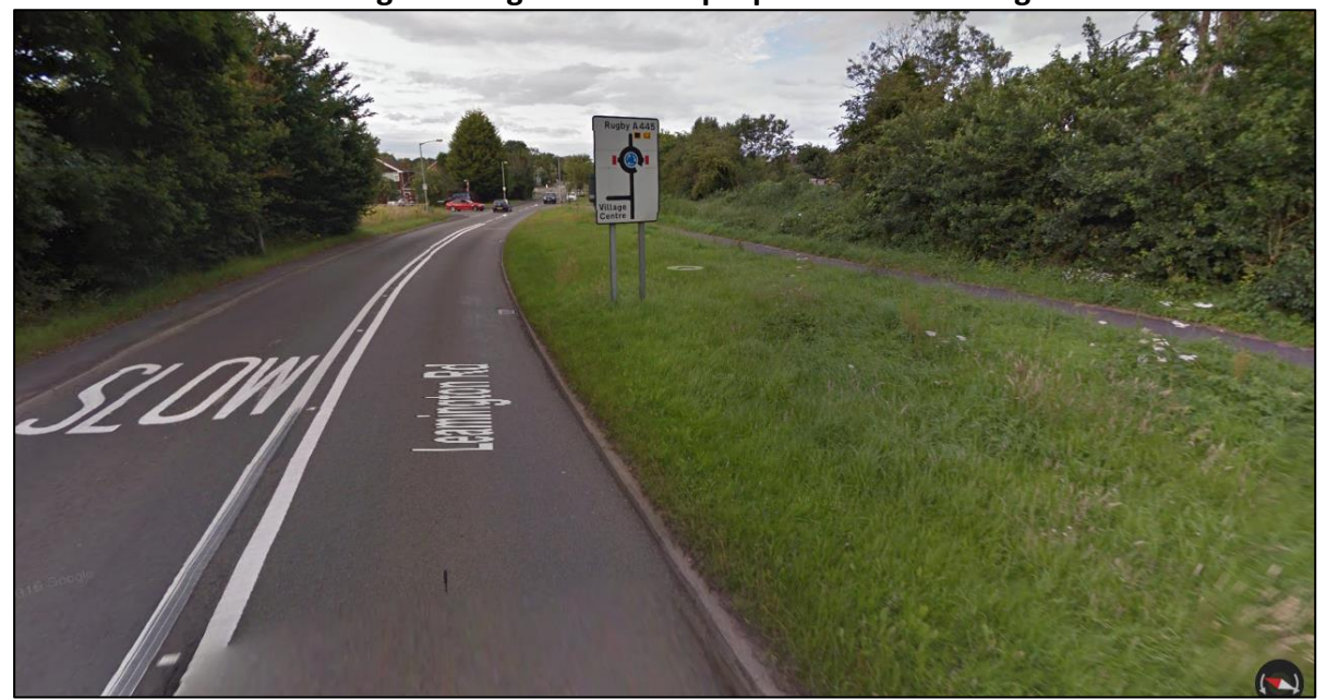
Photo1 - View east along Learnington Road to proposed access on right hand side

The site is proposed to be accessed off Leamington Road, with options possible for either a roundabout or right turn junction. The site will require a suitable minimum visibility splay along Leamington Road and the Highways Authority has indicated this can be provided at this location.