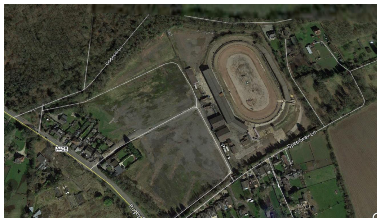
Figure 1.1: Aerial view of Brandon Stadium