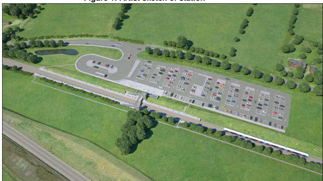
Figure 1: Artist sketch of station