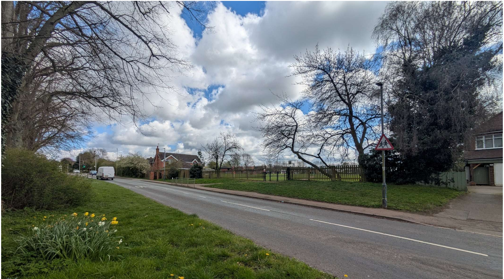
Figure 2.3. Photograph of the Rugby Road entrance to the recreation ground, looking north-east toward Clifton-upon-Dunsmore. 15 Rugby Road is on the right.