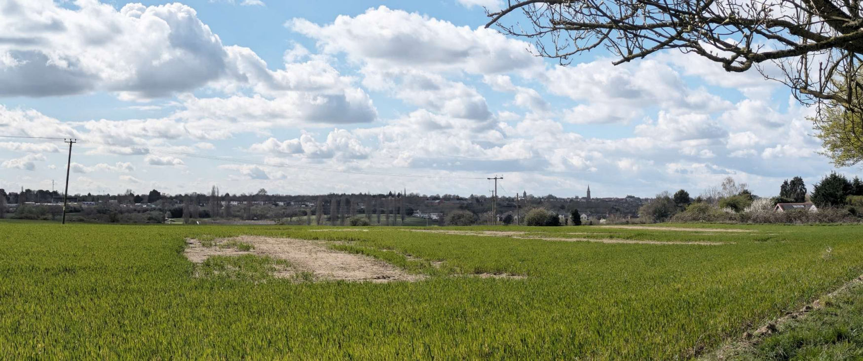
Figure 2.1. Photograph looking south-west from the recreation ground towards the Rugby urban area.