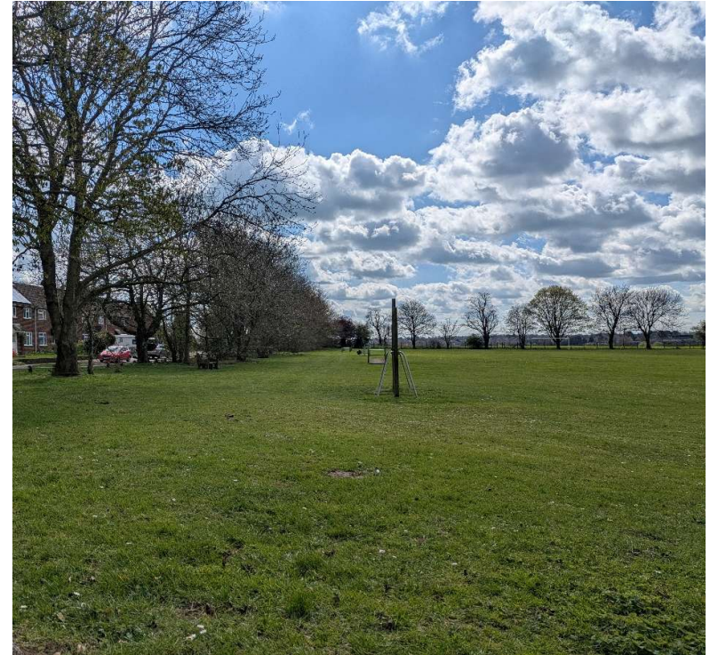
Figure 2.4 + 2.5. Photographs of the current condition of the recreation ground, from Shuttleworth Road (left) and from inside the recreation ground (right).