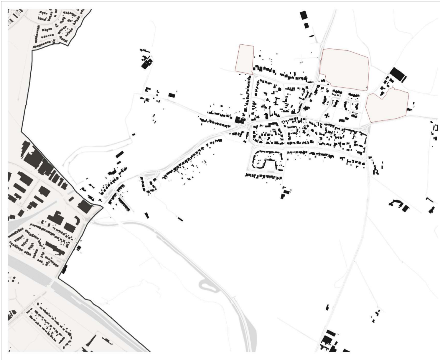
Figure 1.3. Figure ground plan of Clifton-upon-Dunsmore and the edge of the Rugby urban area, with the addition of sites 129, 202 and 307 proposed for allocation in the Proposed Submission Rugby Borough Local Plan (CD.5.25).