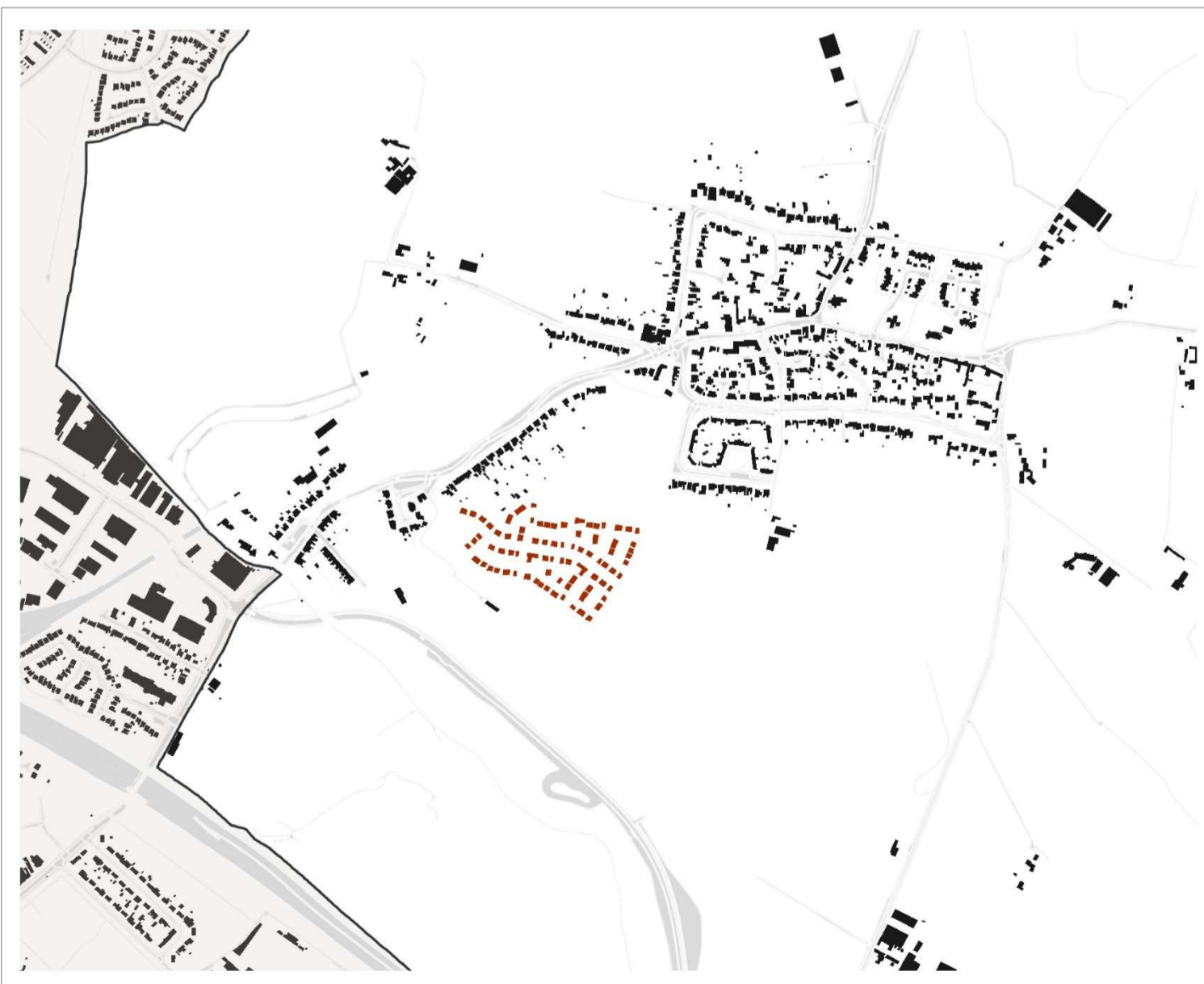
Figure 1.2. Figure ground plan of Clifton-upon-Dunsmore and the edge of the Rugby urban area, with the addition of the appeal scheme as illustrated in the Design and Access Statement (CD.1.34).