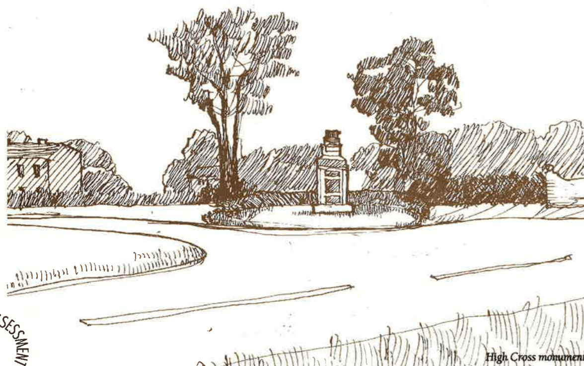
High Cross monument

The farmed landscape is characterised for the most part by large hedged fields. Smaller fields often associated with pockets of permanent pasture are a feature in places. In the area to the south of Cloudesley Bush a number of shelterbelts form prominent features, lending interest and an impression of woodland in what would otherwise be a largely open and featureless landscape. These have been planted along both the northern and eastern boundaries of the parish of Withybrook and along the ridge followed by the B4459 running south-eastward from Cloudesley Bush.