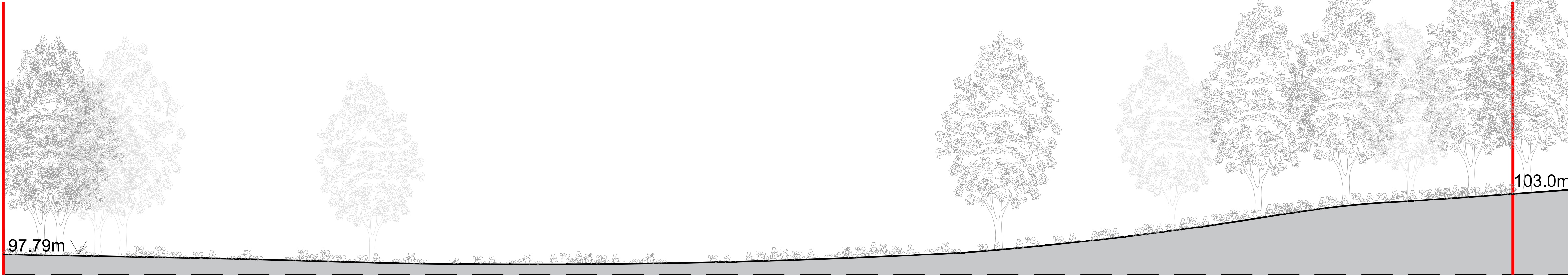
SECTION C-C Datum: 96000