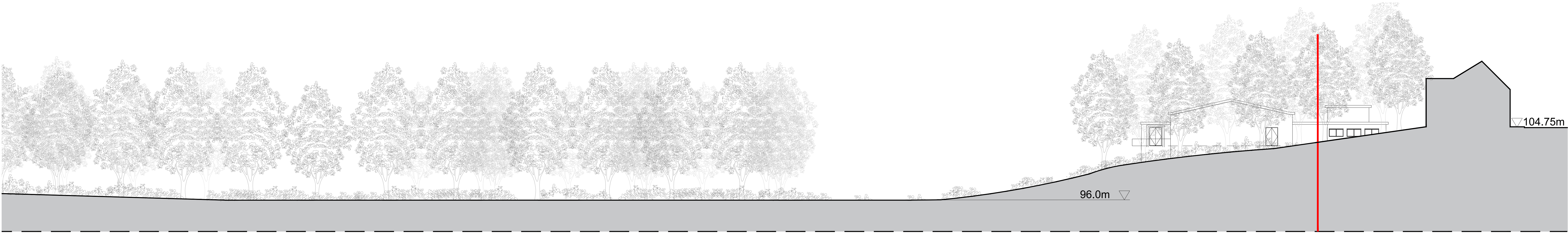
SECTION A-A CONTINUED Datum: 91000