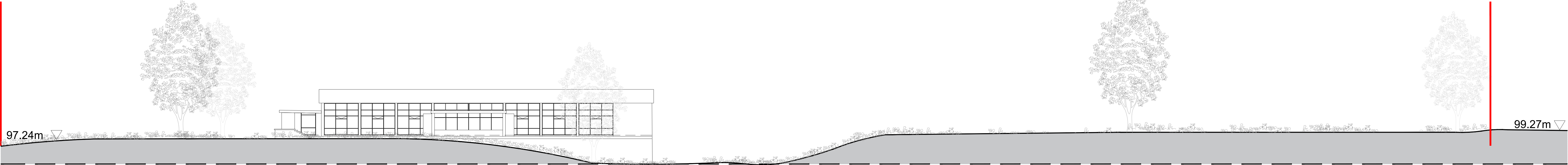
SECTION B-B Datum: 95000