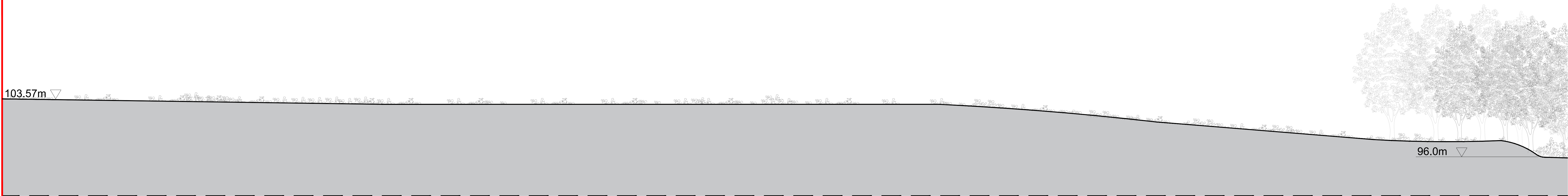
SECTION A-A Datum: 91000