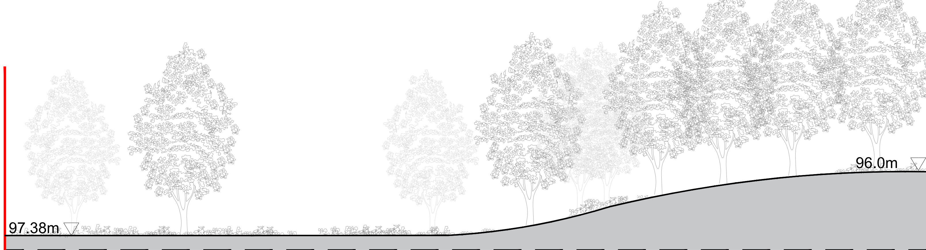
SECTION D-D Datum: 96000