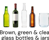
Brown, green & clear glass bottles & jars