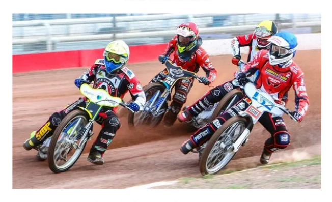
To locate, acquire, obtain planning permission, develop and operate a show ground including a speedway and car racing oval arena with an expandable capacity of up to 5,000 spectators.